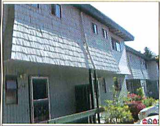
Bolivar Heights 3 bdrm, over 1600 sqft. $254,000