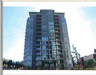
West Coquitlam $319,900 1 Bdrm + den, brand new, no GST