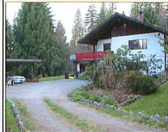
$1,899,900 Burke Mt. Coquitlam 2.11 acres Investment