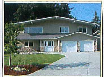
Harbour Place - Coquitlam SOLD for 99% of asking price