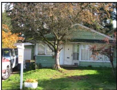
North Surrey / Whalley SOLD!