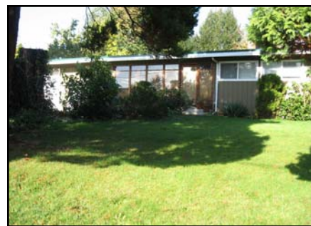
Maple Ridge, West SOLD!