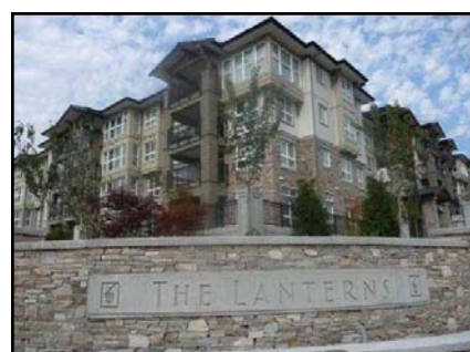
Coquitlam, Westwood Pla- teau SOLD!

"Oh, by the way, if you know of anyone who is thinking of buying or selling a home who would appreciate this same level of service, just give me a call with their name and number. I'll be happy to follow up with them for you". A referral fee will be gladly offered with every sale.