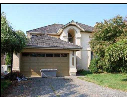
Coquitlam, Westwood Pla- teau SOLD!