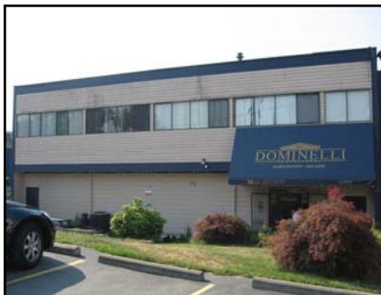
Burnaby, Metrotown Asking $1,749,000