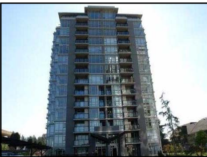
Coquitlam West $294,000 1 Bdrm & Den, Southwest View