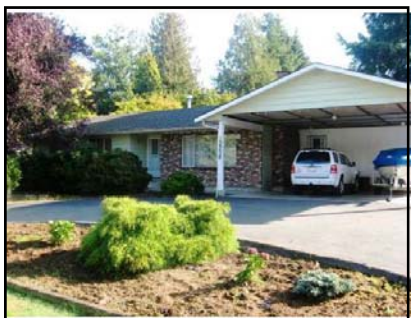
Northwest Maple Ridge SOLD!