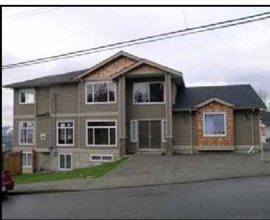
Central Coquitlam SOLD!