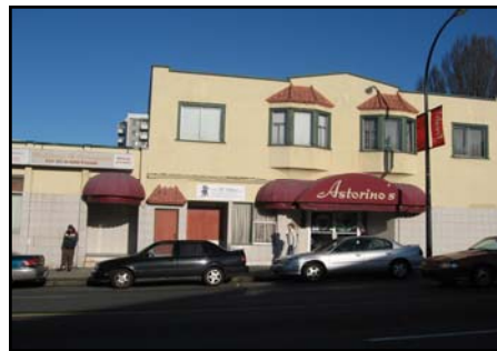
E.Vancouver, Commerical Dr Asking $3,480,000 Banquet Hall w/ frtg on the